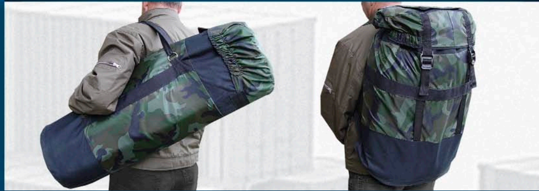
EASY TRANSPORTATION AND DEPLOYING IN ANY TERRITORY.